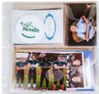
Expanding Project Planners