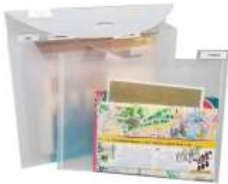
Fab File A4/8.5x11